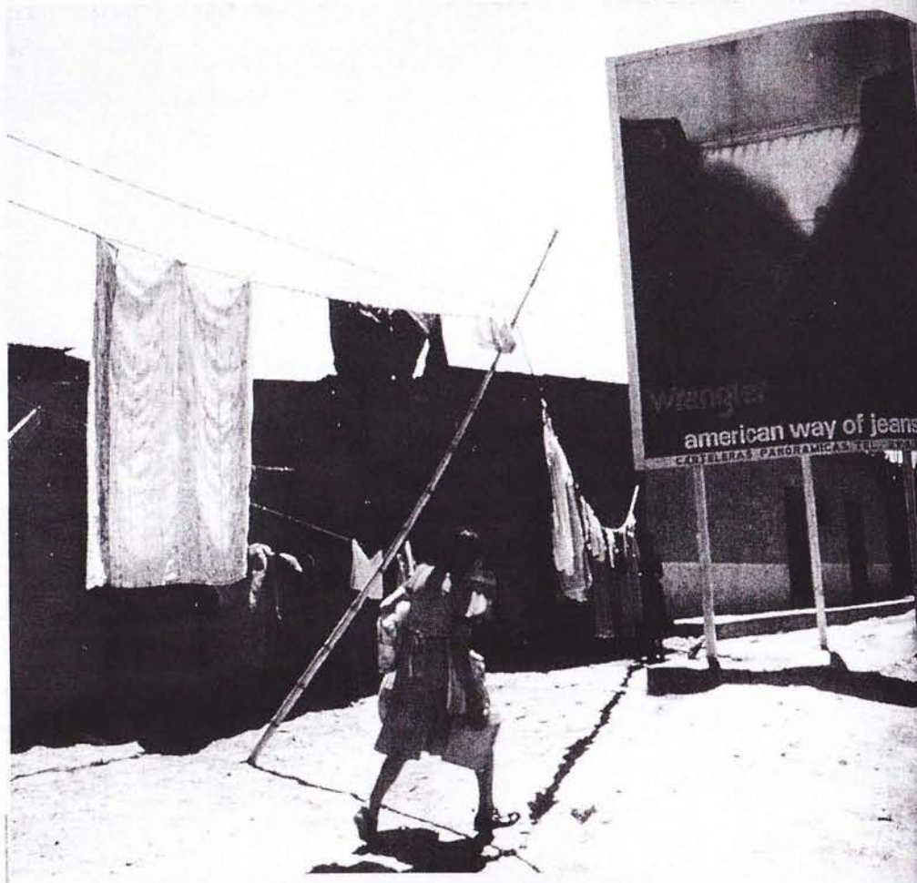
THE PLEASURES OF GLOBALIZATION. At the dawn of the new millennium, consumer culture is everywhere in Latin America. For the well-off minority, the new accessibility of imported goods brings long-awaited satisfactions. But for the poor majority, like the residents of this poor Guatemala City neighborhood, where people can afford to consume little, the lure of consumer culture produces mostly anger and frustration.