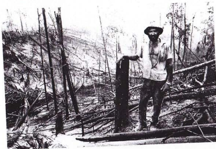
SETTLER IN BRAZILIAN AMAZONIA. Burning the rainforest is a way of clearing it for agriculture. Cleared land in the Amazon basin is unlikely to retain its fertility for more than a few years, yet the burning continues because of demand for land.

A significant fraction of the Amazonian rainforest has already been destroyed, but it still occupies roughly a third of Brazil's national territory, as well as parts of Venezuela, Colombia, Ecuador, Peru, and Bolivia. It remains, by far, the largest tropical forest in the world. Human activity hardly made a scratch on the Amazonian forest until the 1960s. It remained the home of indigenous people living in relatively undisturbed tribal cultures, with a sprinkling of settlers along the major rivers, many of them descendants of rubber tappers who arrived around 1900. Then, in the 1960s and 1970s, the Brazilian military government launched one major World Bank-funded development project after another in the Amazonian rainforest, logging it, cutting highways into it, promoting massive mining projects (iron, gold, manganese, nickel, copper, bauxite) that stripped and tore it,